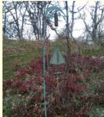
Twisting in the Wind © Jane Welip